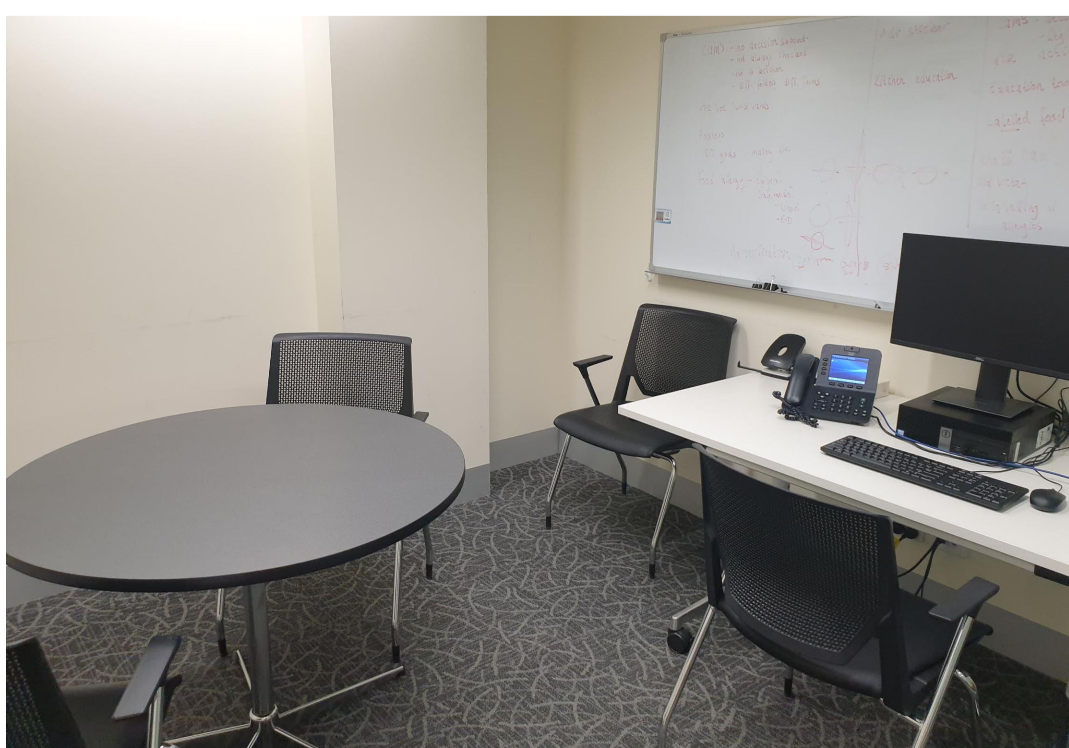
Private room for monitoring activities