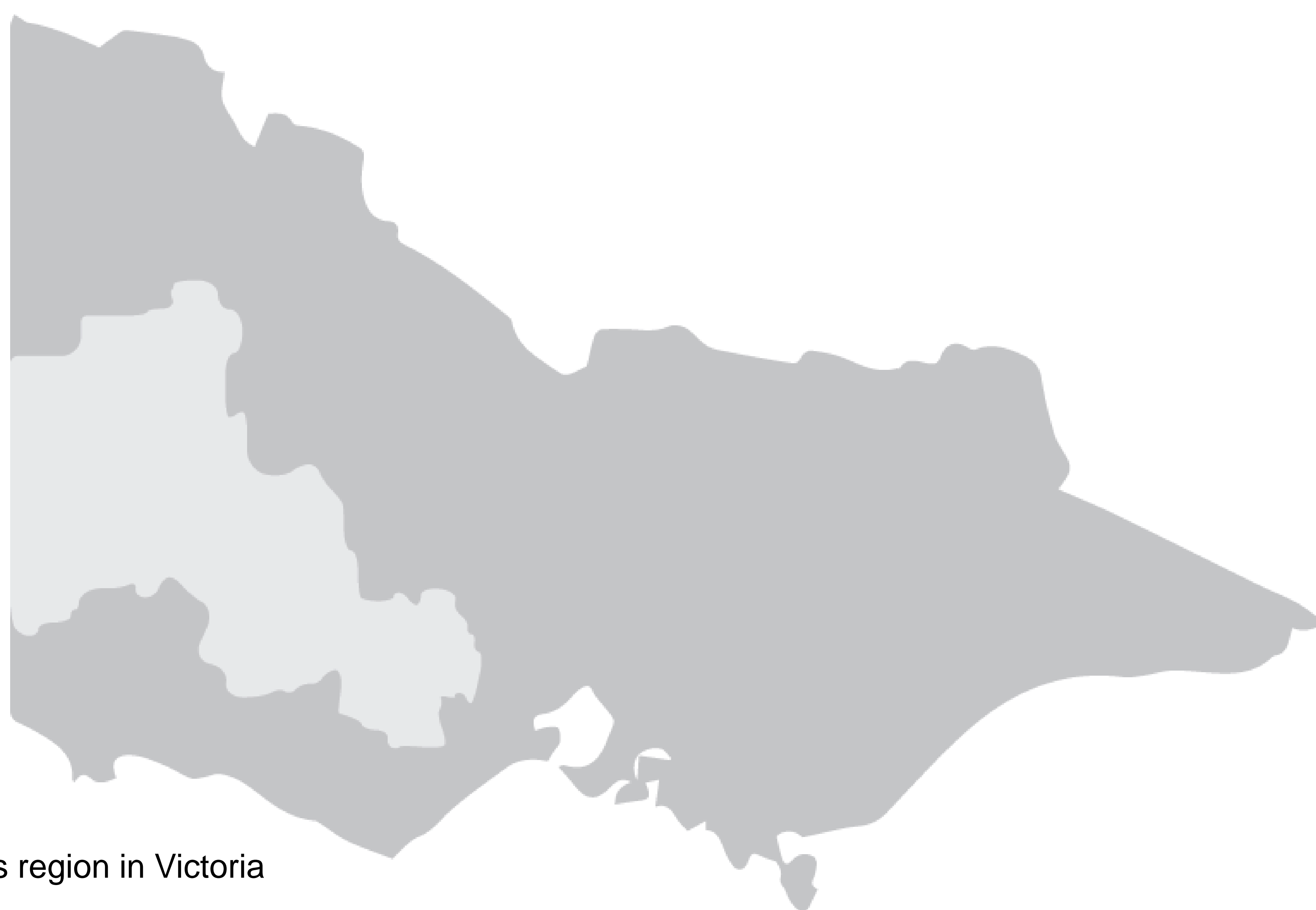
Grampians region in Victoria