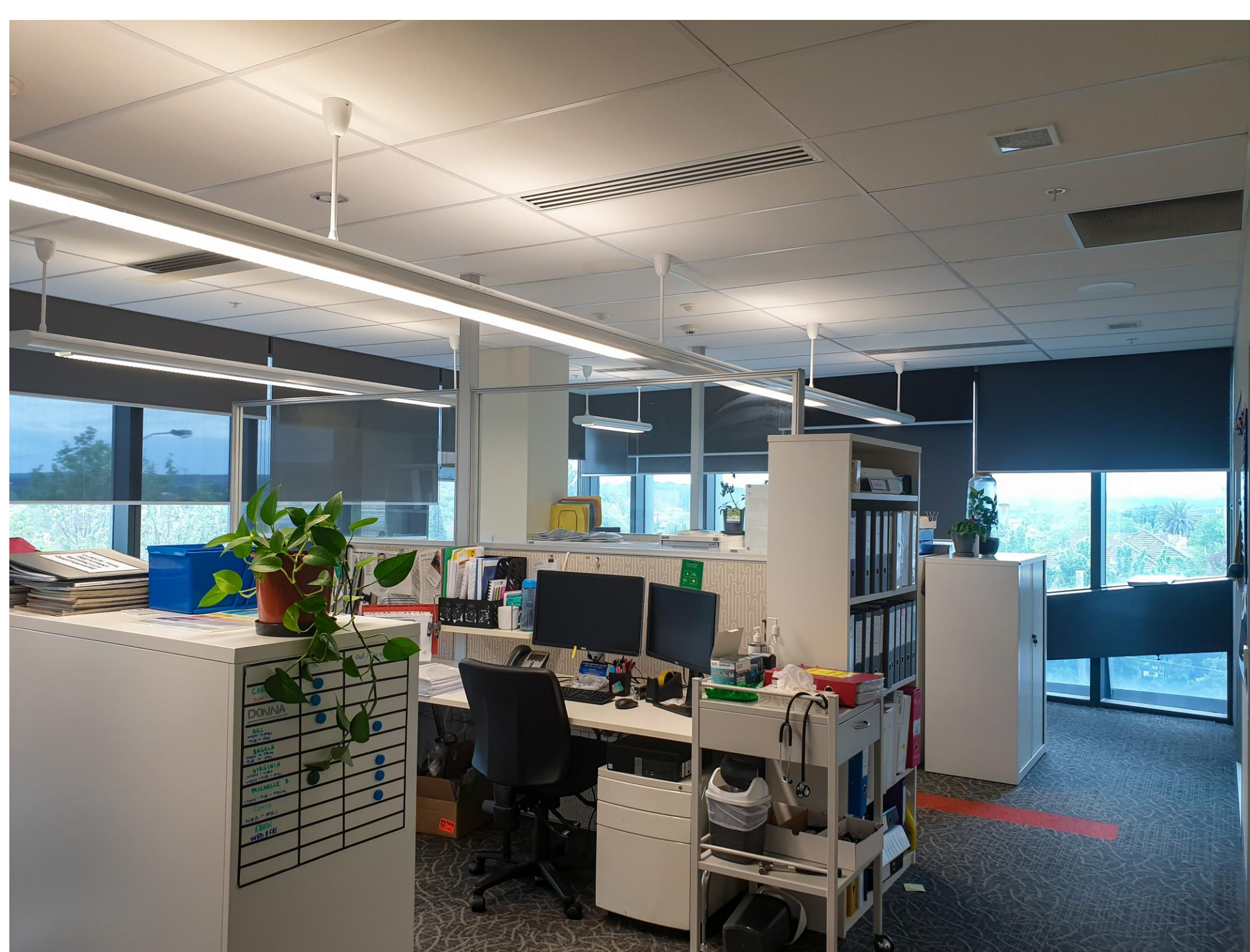
Clinical research office